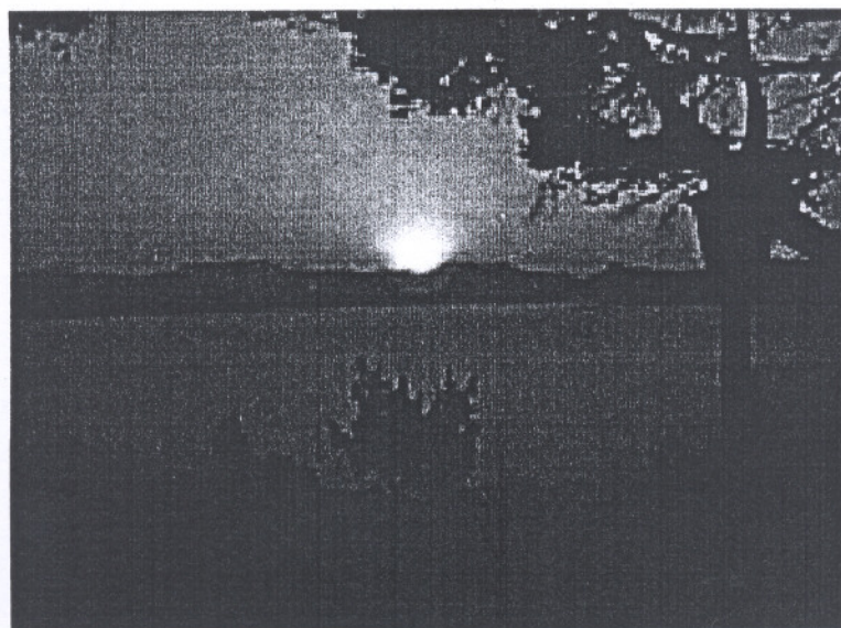
Pollensa Bay (Mallorca)

October 3-5, 2007 Pollensa. Mallorca. Spain