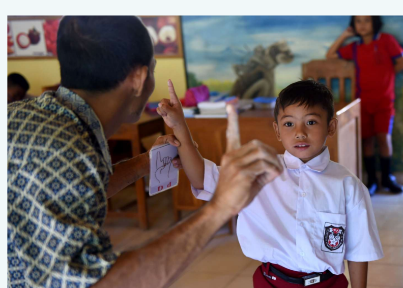
Bengkala, Bali, Indonesia 1960-today