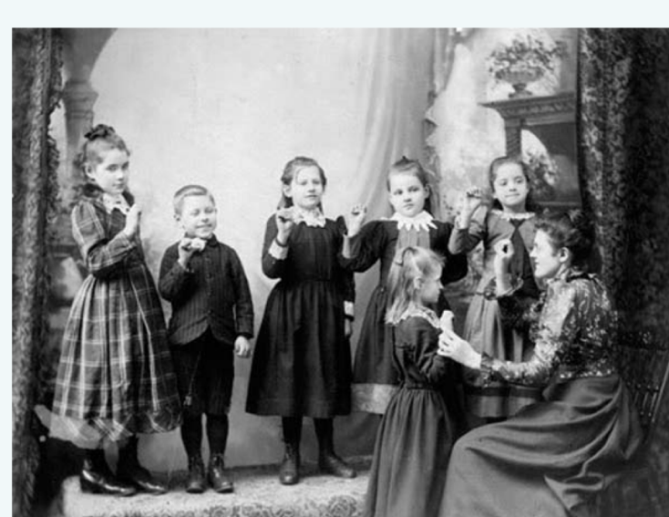
Martha's Vineyard USA, 18th – 20th century

In these places, the majority of the population are/were signers (deaf & hearing).