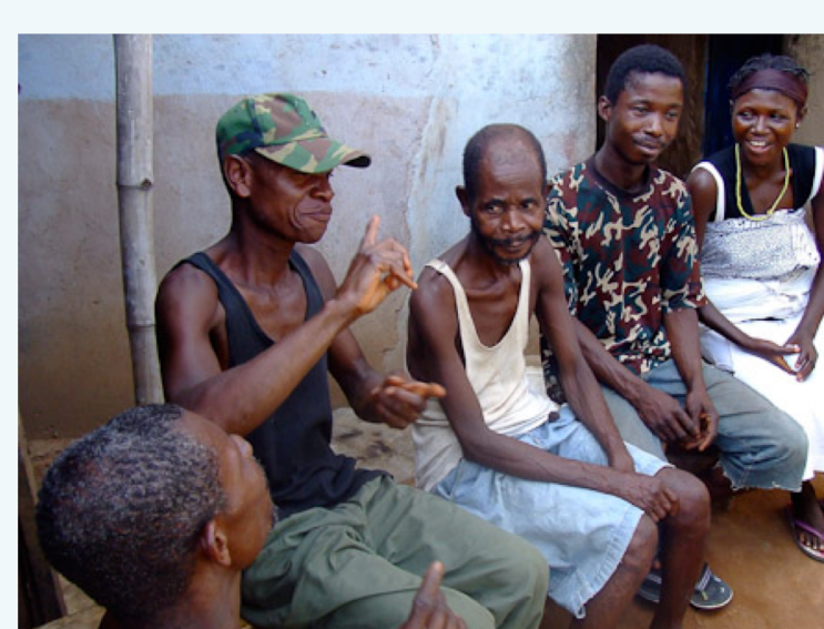
Adamorobe, Ghana 1773? – today