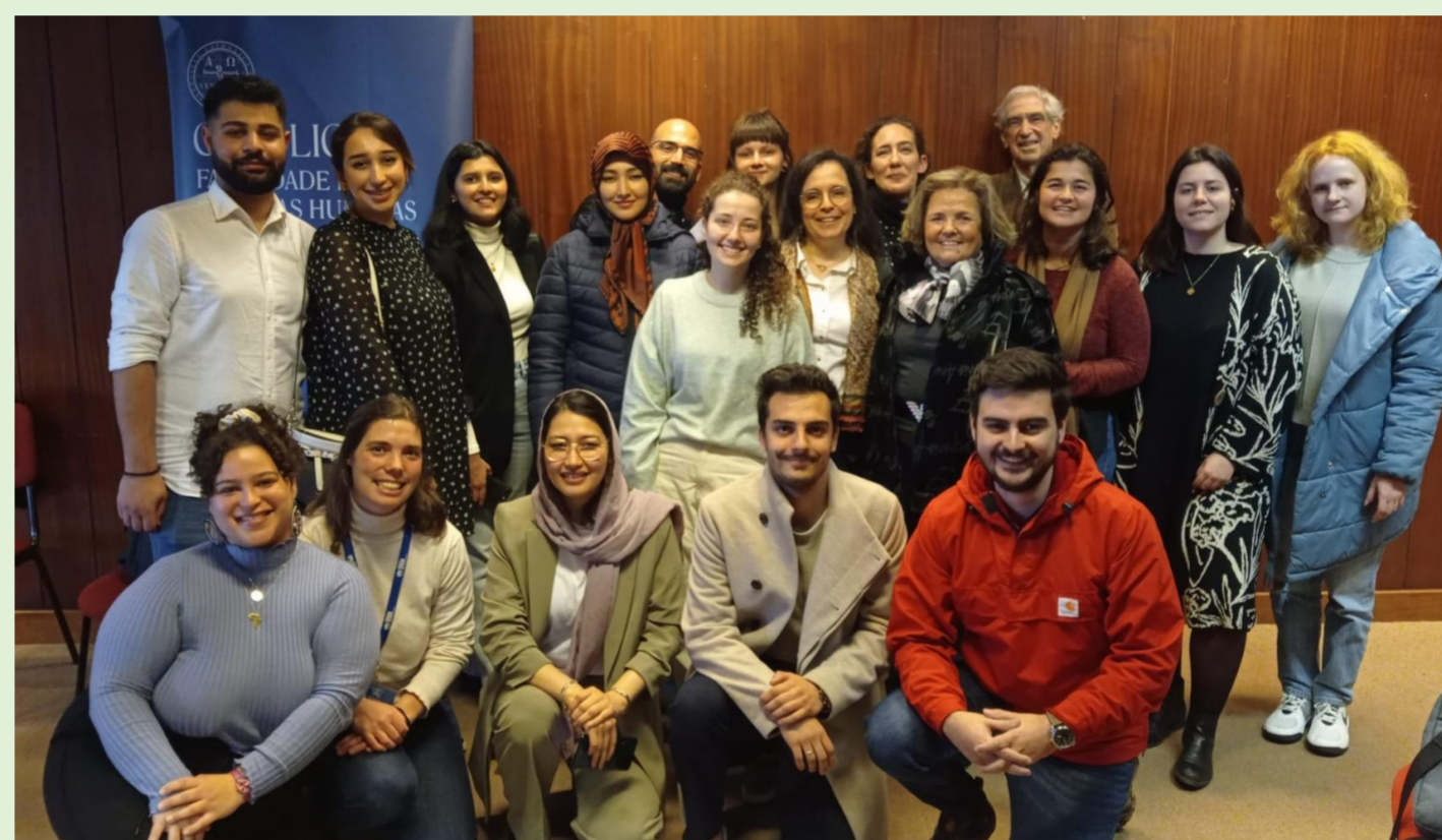
Public Relations students and students with refugee status - Catholic University (Lisbon, March 8, 2023)

Topic for motivation assessment in class (February 27, 2023)