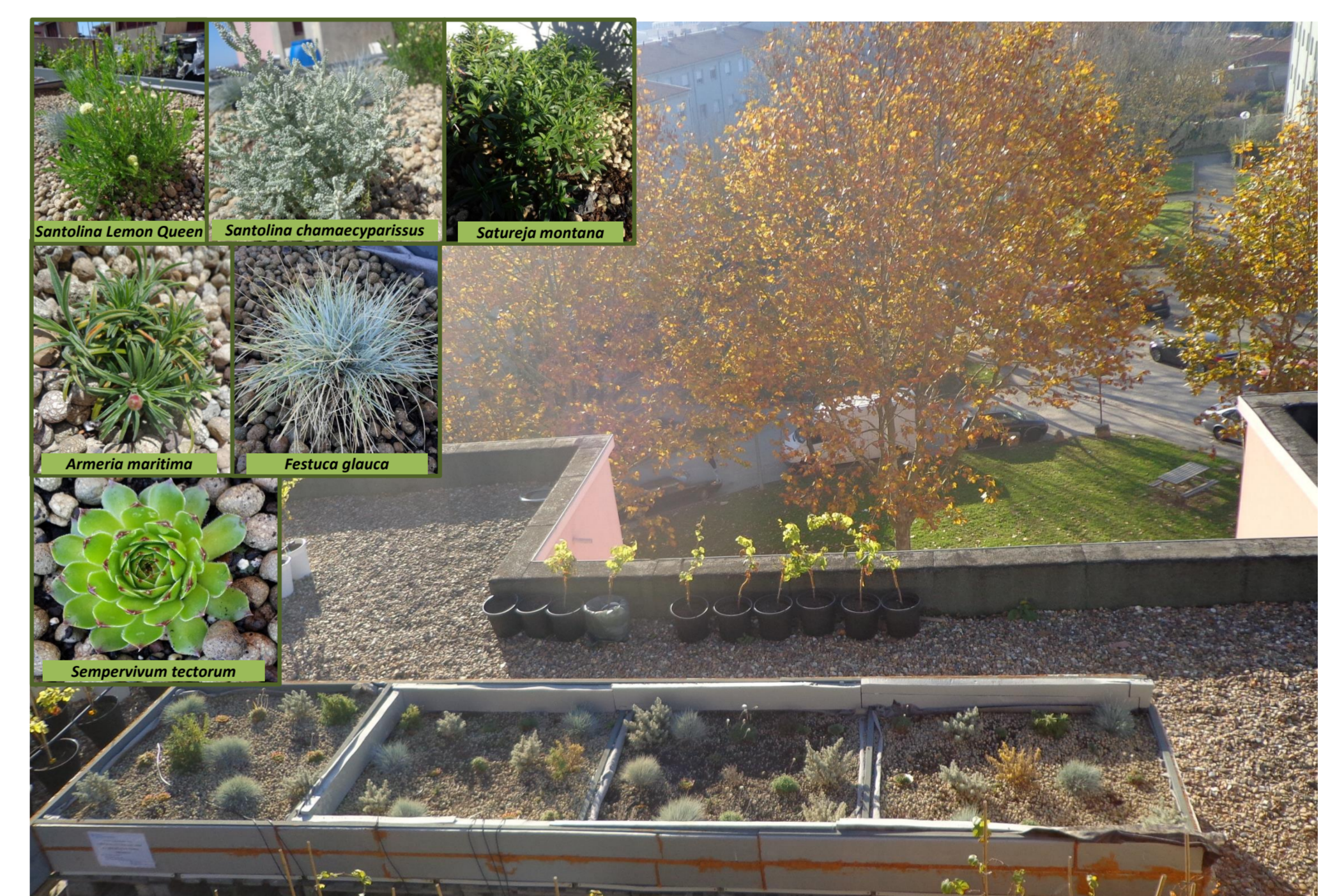
Figure 2: Green roof pilot systems