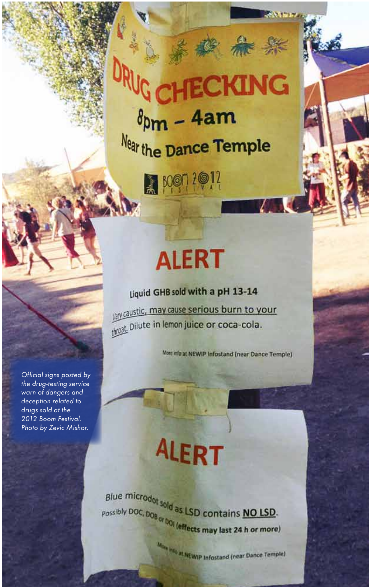
Official signs posted by the drug-testing service warn of dangers and deception related to drugs sold at the 2012 Boom Festival.