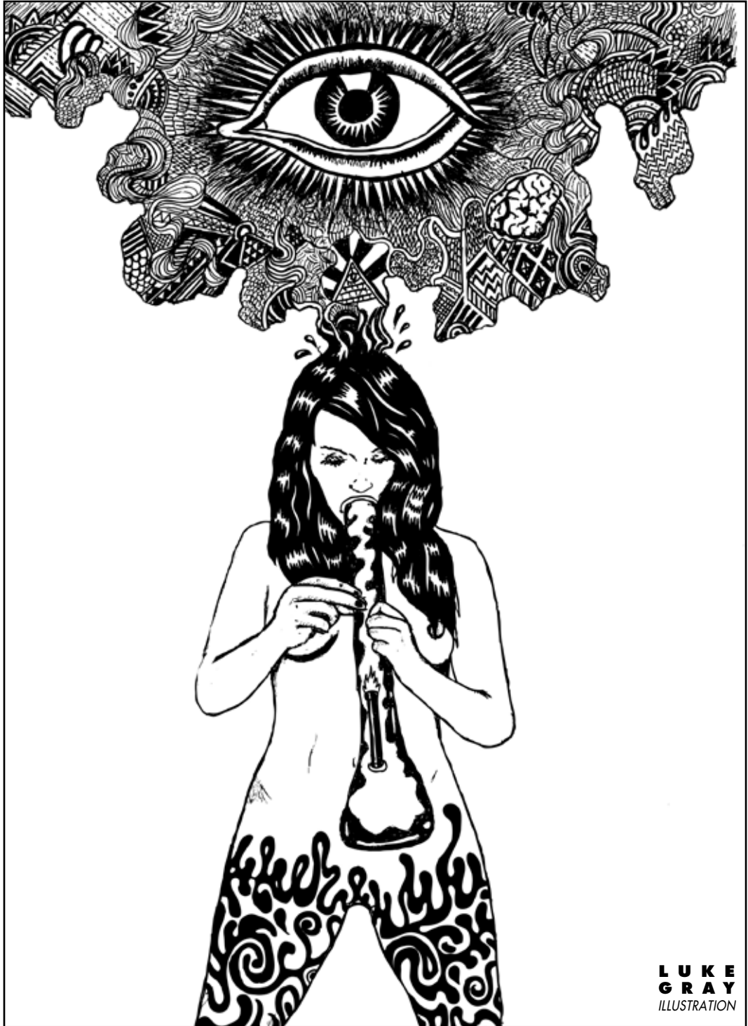
LUKE GRAY • Peace Pipe , 2012 • Staedtler Triplus Fineliner http://www.lukegray.net