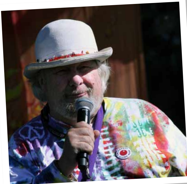
Wavy Gravy, still helping out on the festival circuit after all of these years; seen here at the 2010 Harmony Festival in California.

In the mid-1960s a group of forty people associated with the Grateful Dead and the Merry Pranksters were offered a job feeding hogs in exchange for rent-free living on a Southern California mountaintop. The community, now known as the Hog Farm, is widely considered the longest running hippie commune in the United States. The Hog Farmers are best known for their services at the 1969 Woodstock Music & Art Fair, which attracted nearly half a million participants. Recruited by event organisers to build fire pits and trails on the festival grounds in Woodstock, New York, the Hog Farmers persuaded the promoters to let them set up a free kitchen. After flying into New York, the group was met by the press at the airport and informed that they had been assigned the job of providing security at the festival, which had been hastily relocated to a 600-acre dairy farm. Hog Farm co-founder and professional clown Wavy Gravy named this security team the "Please Force" (as in please don't do that, please do this instead) to reflect their non-intrusive approach. When asked by reporters what the group's strategy was for keeping order, Gravy replied, "Cream pies and seltzer bottles".