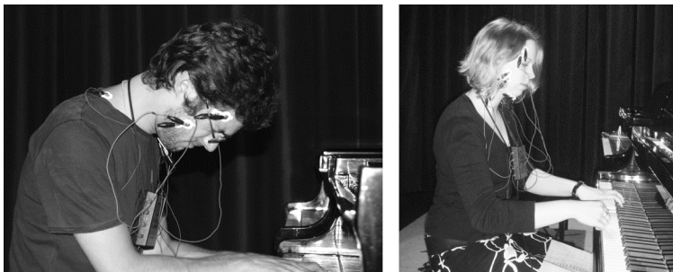
Figure 1. Pianists performing a jazz and a classical piece

Subjects played a piece of their choice in classical style (Figure 1 on the right) and jazz style (Figure 1 on the left). A resting period of one minute between recordings was allowed, to avoid muscular fatigue.