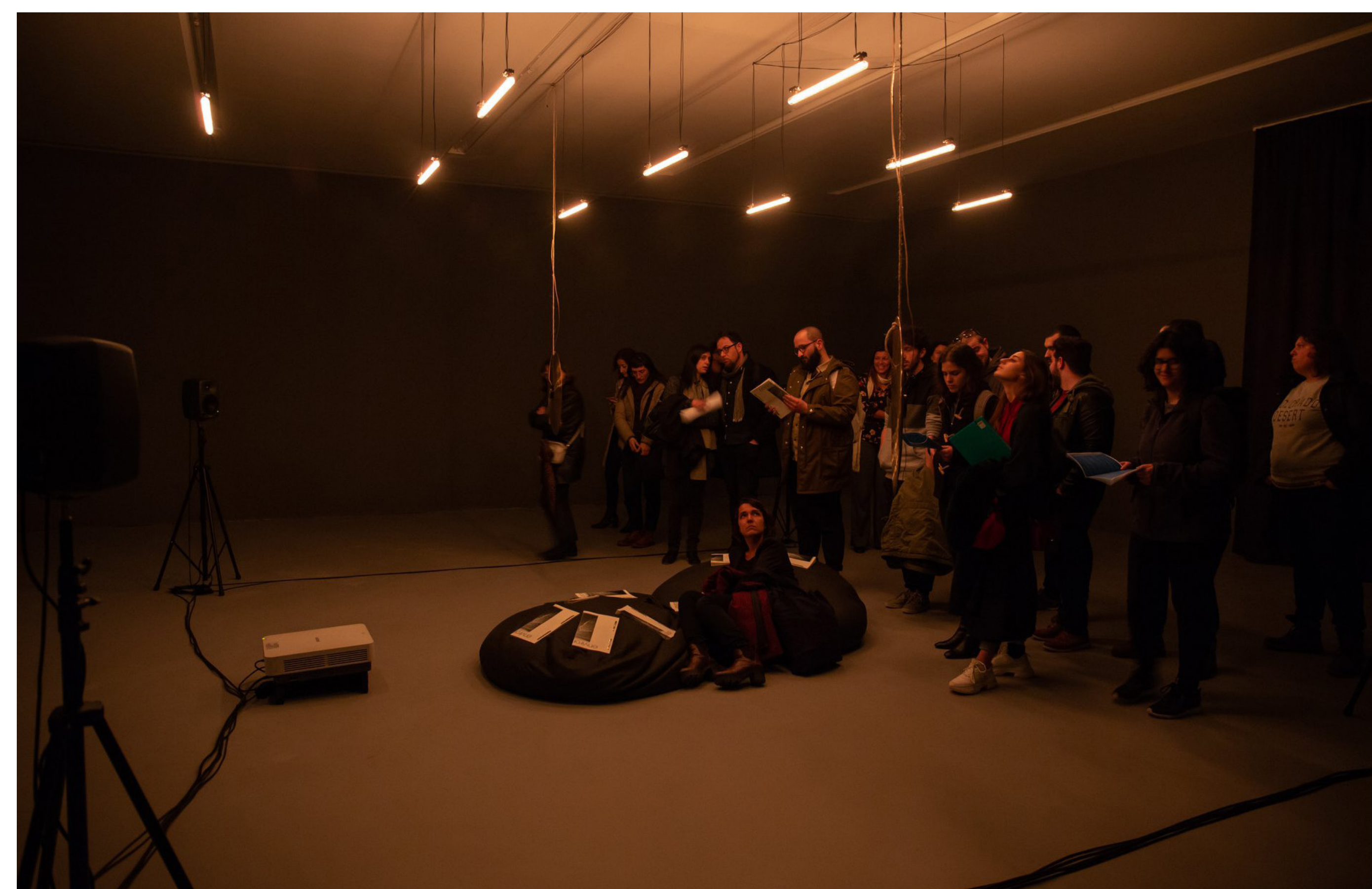
Exhibition view of POETRY AS AN ECHOLOGICAL SURVIVAL, by Nuno da Luz