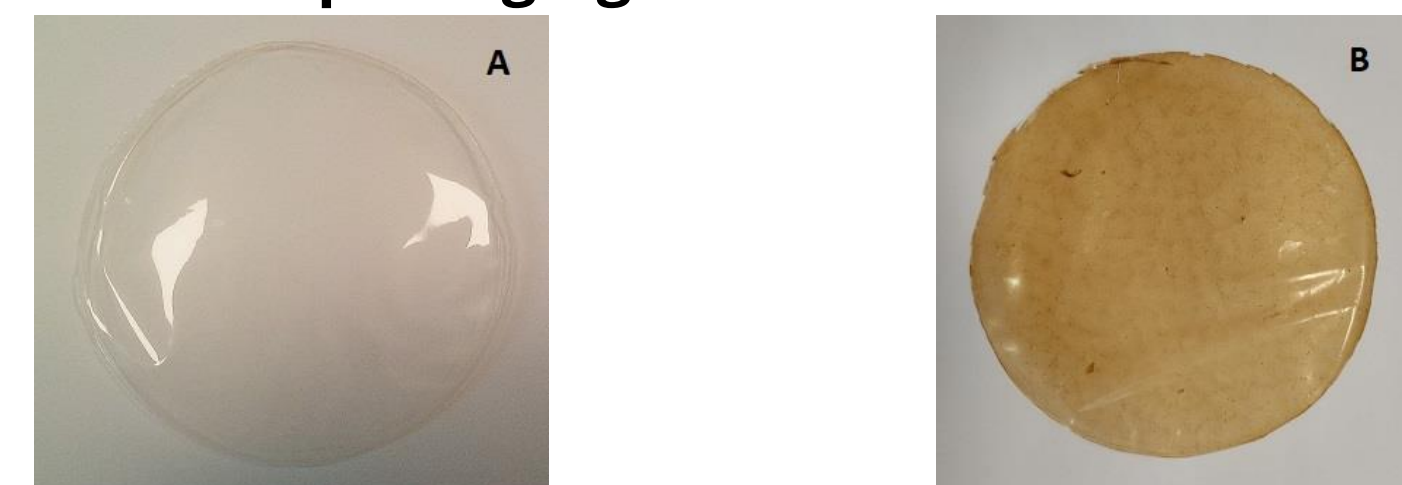
Figure 2. A - Alginate (3%) edible film; B - Alginate (2%) + Fucus sp. PS (0.5%) + bioactives extract (0.25%) edible film.