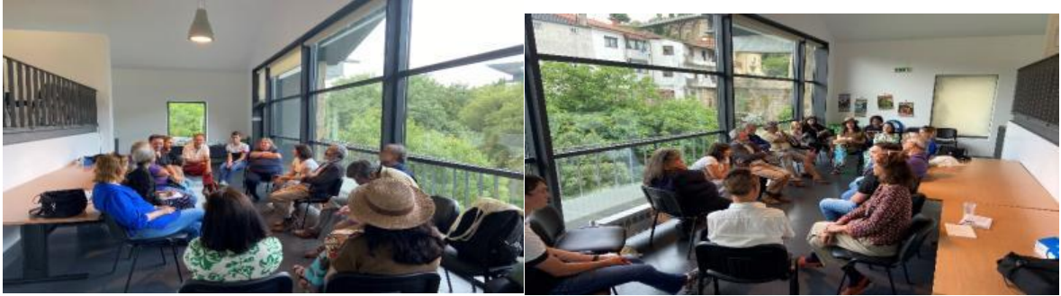
Public Work Session – Rosa do Mundo Project