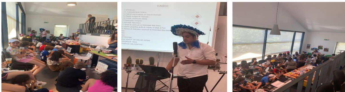
Workshop - The indigenous experience and its relationship with the environment