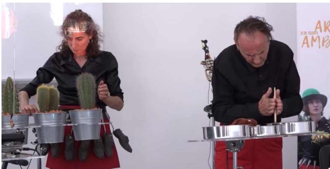
Concert performance “HÁ-SOM”