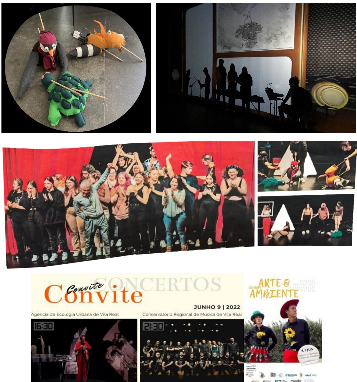
Vila Real’s Biodiversity Tales