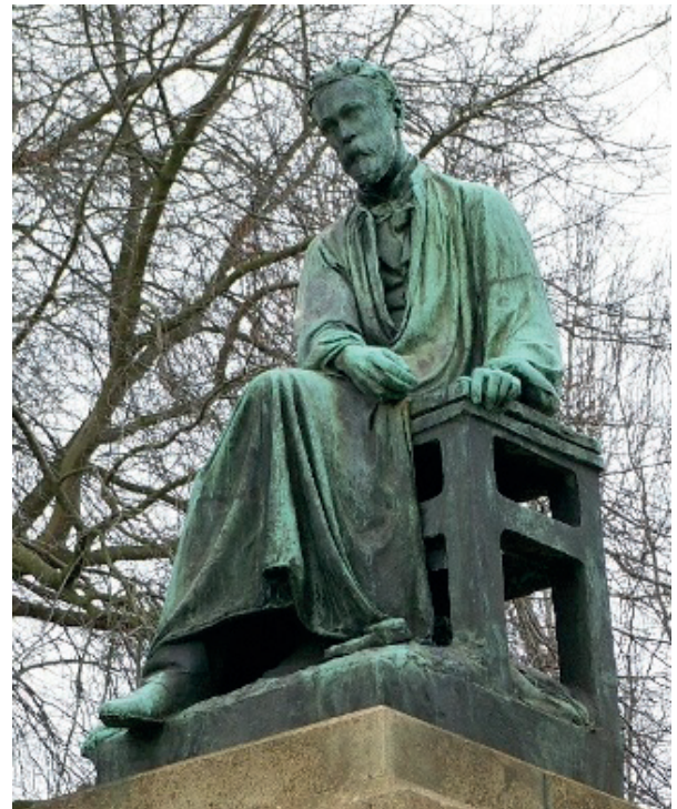
Fig. 02. Teixeira Lopes, Monument to Soares dos Reis, 1904, Bronze, Soares dos Reis’ Garden, Vila Nova de Gaia.